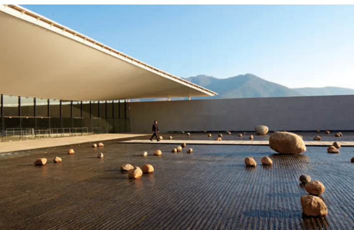
Clockwise: The hilltop Vik Chile hotel, designed by Marcelo Daglio; the Viña Vik winery; master suite; tasting room

T wo hours south of Santiago in the fertile Millahue Valley, I arrive at Vik Chile's hilltop hotel to find a landscape lost in chilly winter fog. But as the morning progresses, soft golden light slowly unveils a narrow valley of colorful wetlands and glassy lagoons hemmed in by rolling, wooded hills, with vineyards patterning the lower slopes. Brilliant sunshine soon transforms the grey surroundings into a vibrant painting. The native Mapuche meaning of Millahue—"place of gold"—is immediately clear. And that golden light is responsible for much more than picturesque vistas: It's also a key component in creating the world-class silky red wines of Viña Vik, Vik Chile's accompanying